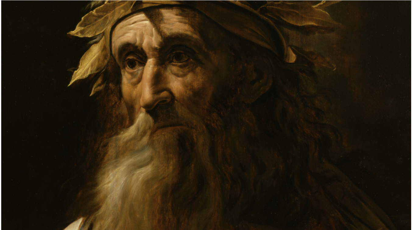
Portrait of the Poet Homer - Walters Wikimedia Commons