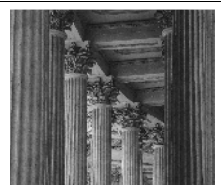
The tops of the columns were <u>elaborately</u> decorated.

Rihanna's <u>elaborate</u> dress was covered in jewels and feathers.