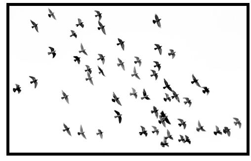
Birds have absolute freedom to go wherever they like.

My mother's no was <u>absolute</u>. Once she said it, there was no chance of changing her mind.