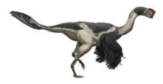
Illustration Credit: Zhao Chuang, Courtesy of Peking Natural Science Organization

Citipati lived about 80 million years ago. These bird-like theropods grew to about nine feet long, with a toothless beak and feathered tail and front limbs.